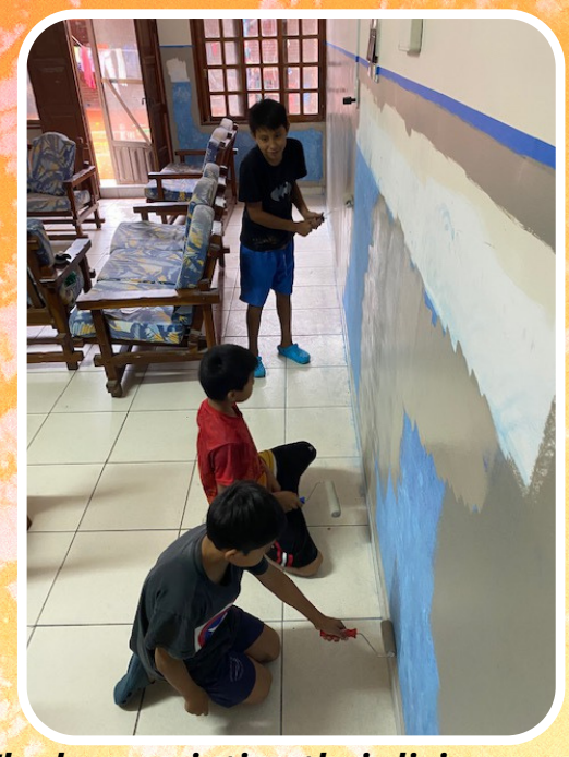
The boys painting their living room.

Taking school classes by Zoom presents its technical difficulties and sometimes sending in homework is easier said than done, but all of the aunties and children are adapting well.